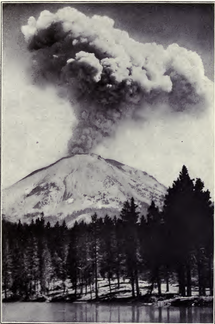
FIG. 9.—Eruption of October 6, 1915, seen from Manzanita Lake, at a distance of 5 miles. A column of "smoke," composed of steam, black with volcanic dust, rose from the crater and at a height of about 3,000 feet above the crater spread to the mushroom form shown in figure 9 about 30 minutes after the eruption began. Photo © by C. Mullen, who took three views of the eruption, at 10-minute intervals, to show its progress. The "lid" of new lava, formed about May 22, 1915, fills the old crater at the time this view was taken, but can not be clearly seen on account of new snow and cloud shadows.